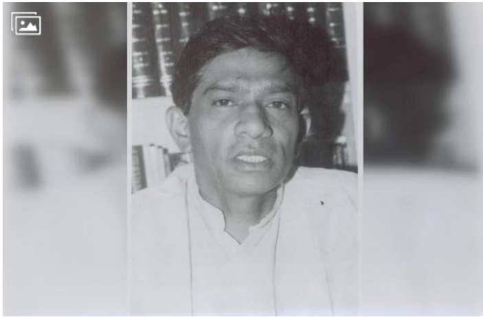
RIP Ajit Jogi: The IAS officer who went on to become Chhattisgarh's first chief minister