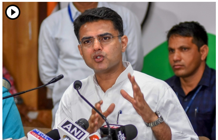
Sachin Pilot: Not enough was done by Delhi to help states fight Coronavirus