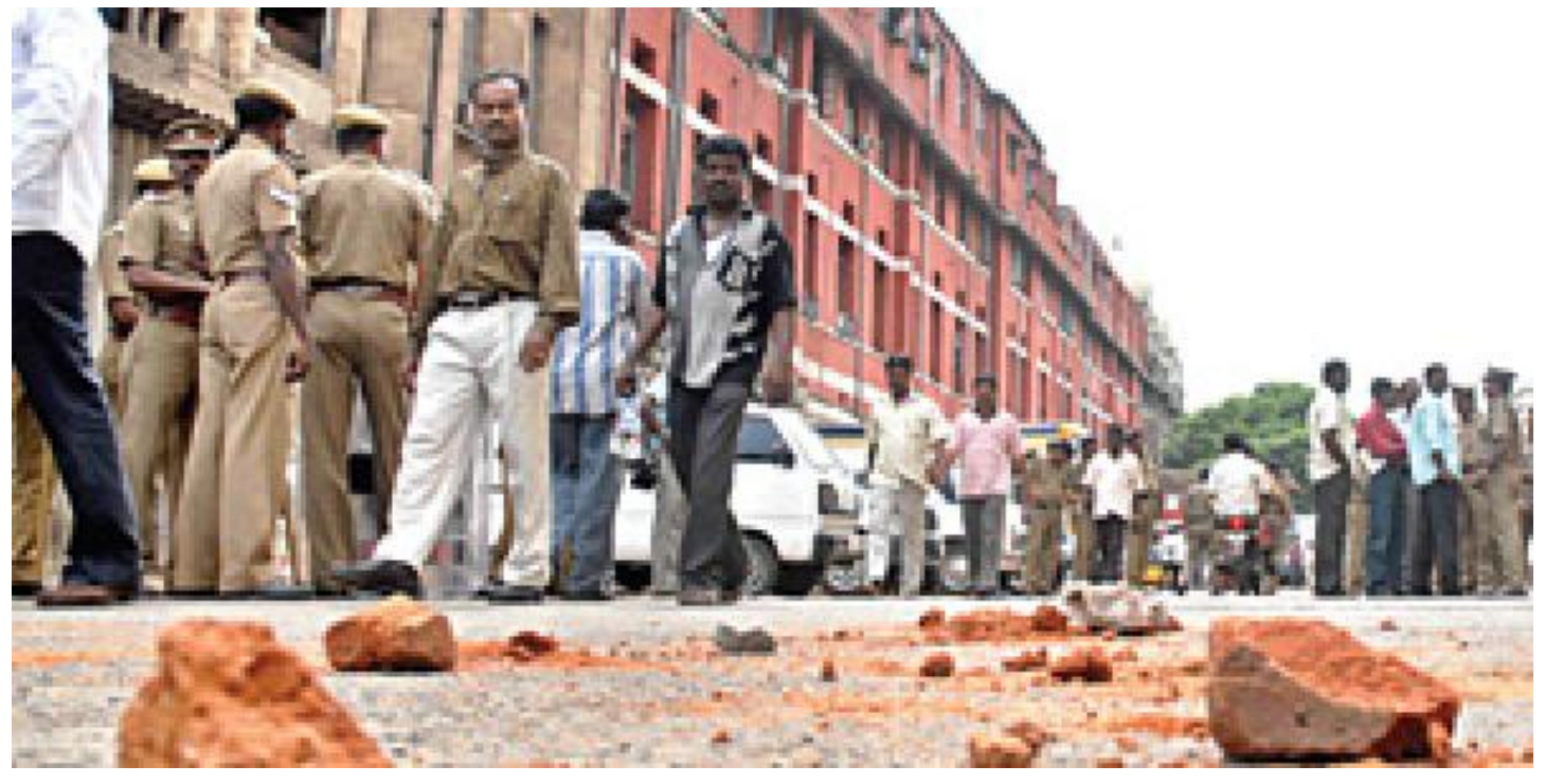
Southern Railways headquarters in Chennai shut as staff tests positive for COVID-19