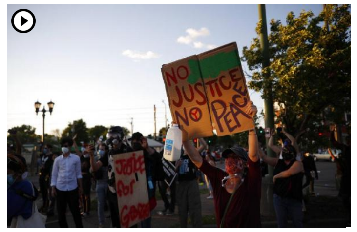
US condemns death of George Floyd, violent protests continue across the country