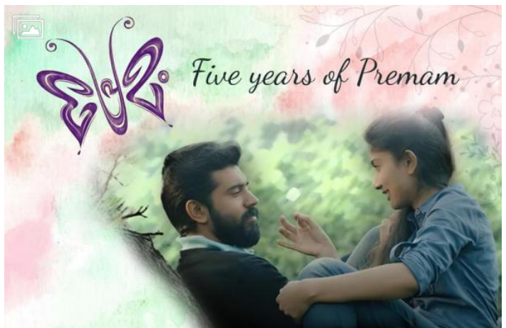
5 years of Premam: Best scenes from the Nivin Pauly-Sai Pallavi romantic hit that we all love to rewatch