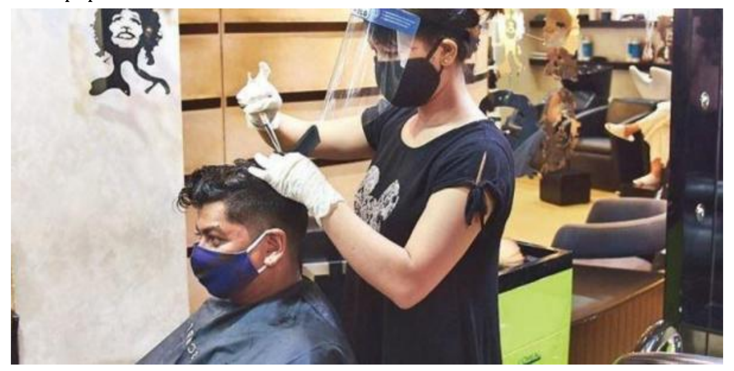
This is how getting a haircut post COVID-19 lockdown looks like