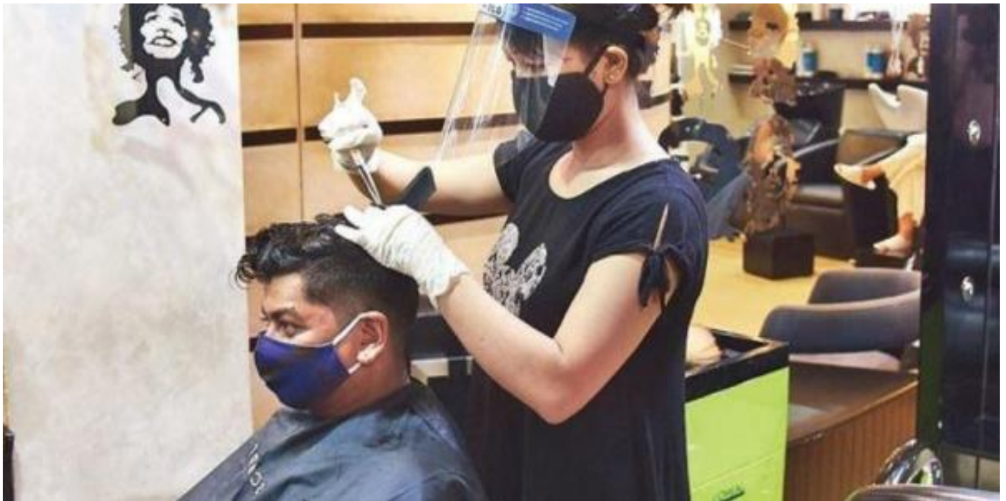
This is how getting a haircut post COVID-19 lockdown looks like