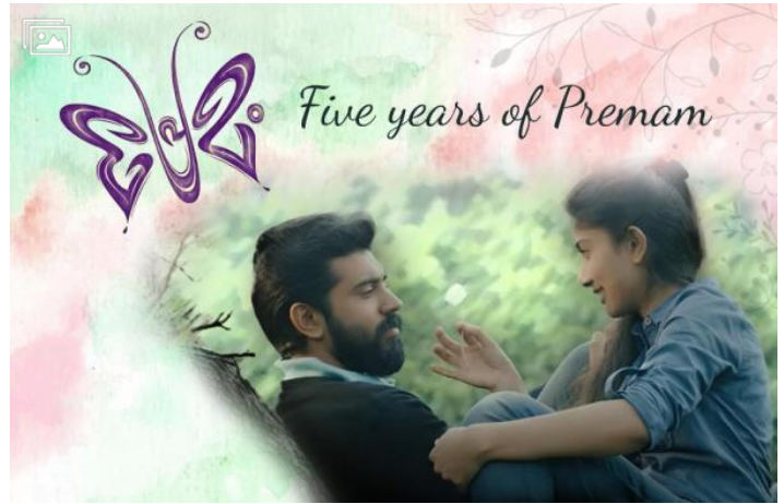
5 years of Premam: Best scenes from the Nivin Pauly-Sai Pallavi romantic hit that we all love to rewatch