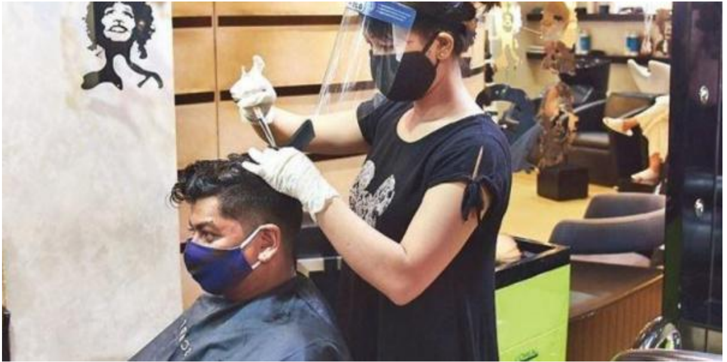
This is how getting a haircut post COVID-19 lockdown looks like