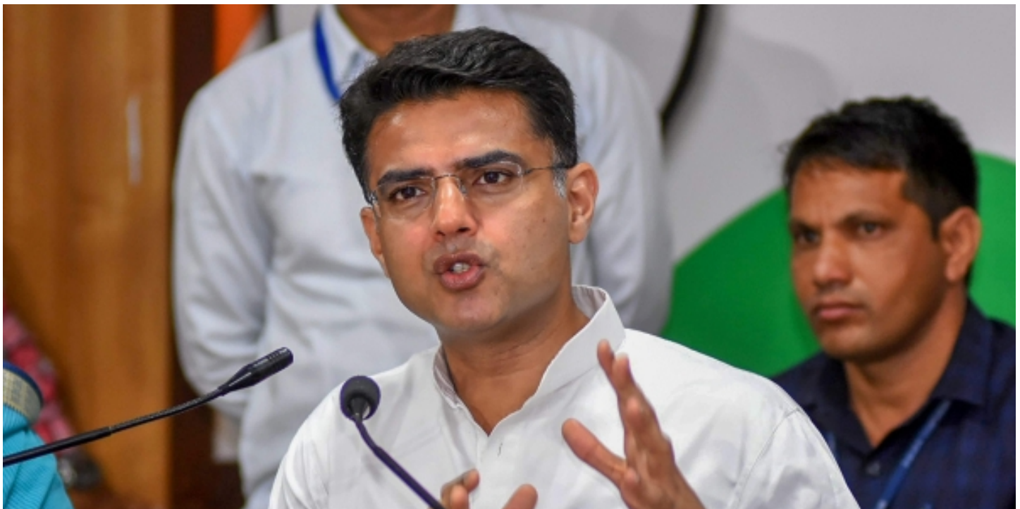
Sachin Pilot: Not enough was done by Delhi to help states fight Coronavirus