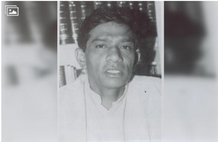
RIP Ajit Jogi: The IAS officer who went on to become Chhattisgarh's first chief minister