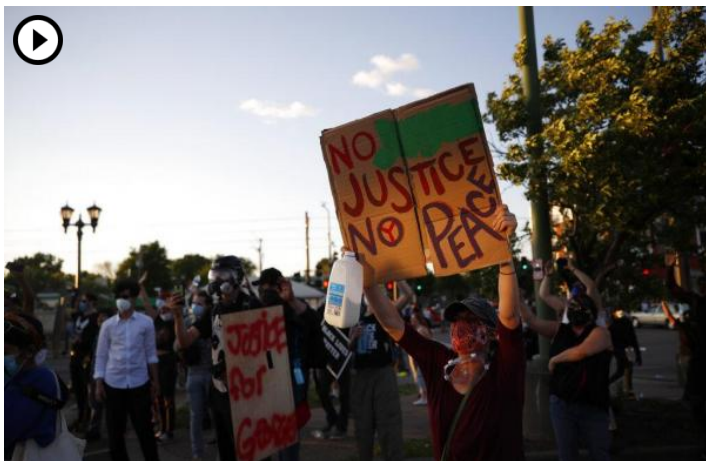
US condemns death of George Floyd, violent protests continue across the country