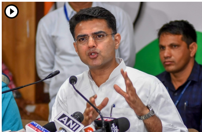
Sachin Pilot: Not enough was done by Delhi to help states fight Coronavirus