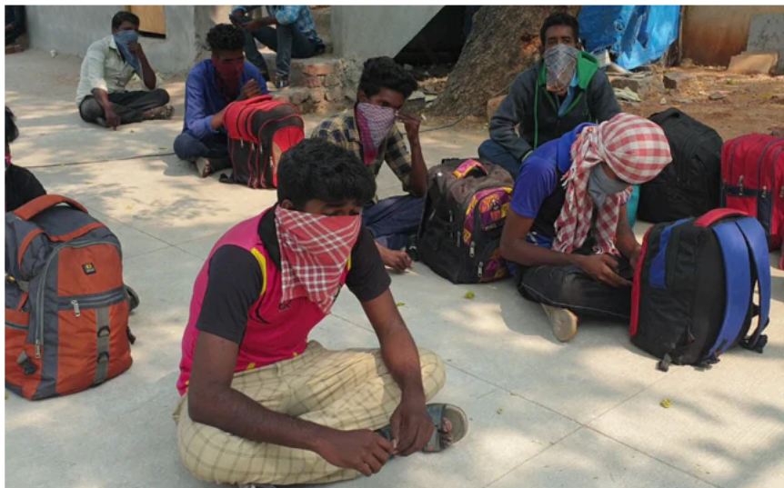
India Lockdown: The abrupt 21-day lockdown has triggered a massive crisis across the country.