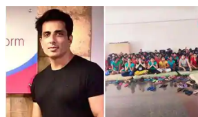
Sonu Sood airlifts 169 Odisha girls from Kerala to their home