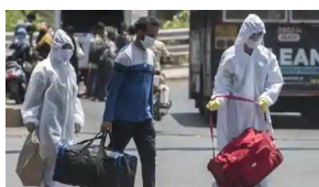
Maharashtra sees 116 deaths, 2,682 new Covid-19 cases take state tally past 62,000