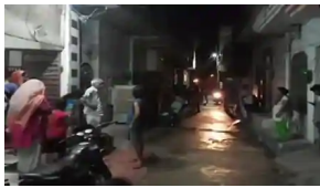
Tremors in Delhi after 4.5 magnitude earthquake in Haryana, then one more