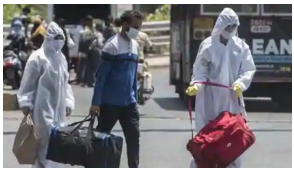
Maharashtra sees 116 deaths, 2,682 new Covid-19 cases take state tally past 62,000