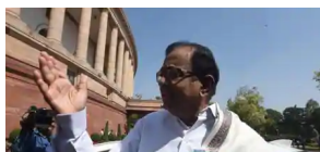
'Remember, this is pre-lockdown': Chidambaram warns on 11-yr low GDP slump