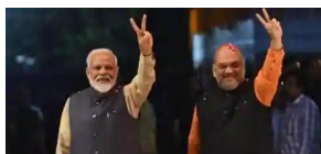
Amid pandemic woes, Modi govt to mark anniversary with accomplishments list