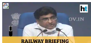
'3,840 special trains operated, 52 lakh passengers moved till now': Railways