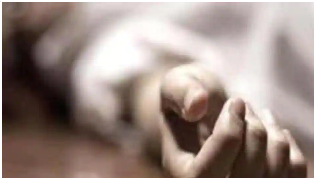
It was not immediately clear whether the patient attempted suicide.

f A coronavirus patient died at a hospital here on Friday allegedly after consuming some toxic liquid at the community health centre he was admitted to in Sarsaul in Uttar Pradesh's Kanpur Dehat district, a health official said.