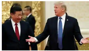
In Donald Trump’s order to raise bar for social media giants, China is the ammo