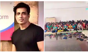
Sonu Sood airlifts 169 Odisha girls from Kerala to their home