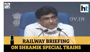
'3,840 special trains operated, 52 lakh passengers moved till now': Railways