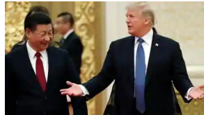
In Donald Trump's order to raise bar for social media giants, China is the ammo