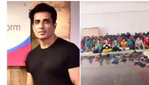
Sonu Sood airlifts 169 Odisha girls from Kerala to their home