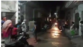
Tremors in Delhi after 4.5 magnitude earthquake in Haryana, then one more