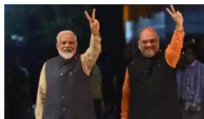
Amid pandemic woes, Modi govt to mark anniversary with accomplishments list