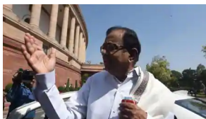
'Remember, this is pre-lockdown': Chidambaram warns on 11-yr low GDP slump