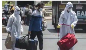
Maharashtra sees 116 deaths, 2,682 new Covid-19 cases take state tally past 62,000