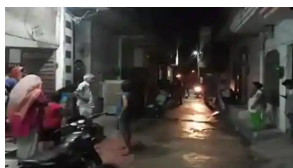
Tremors in Delhi after 4.5 magnitude earthquake in Haryana, then one more