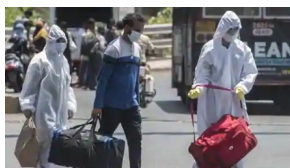
Maharashtra sees 116 deaths, 2,682 new Covid-19 cases take state tally past 62,000