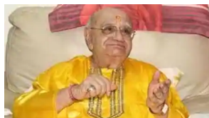
Bejan Daruwalla, famous astrologer, dies at 89