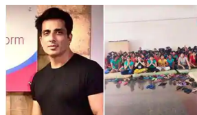
Sonu Sood airlifts 169 Odisha girls from Kerala to their home