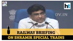
'3,840 special trains operated, 52 lakh passengers moved till now': Railways