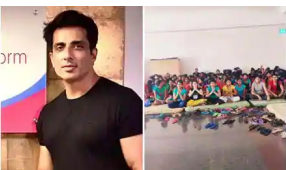
Sonu Sood airlifts 169 Odisha girls from Kerala to their home