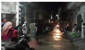
Tremors in Delhi after 4.5 magnitude earthquake in Haryana, then one more