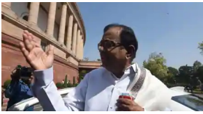
'Remember, this is pre-lockdown': Chidambaram warns on 11-yr low GDP slump