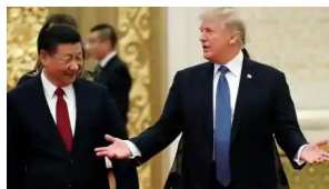
In Donald Trump's order to raise bar for social media giants, China is the ammo