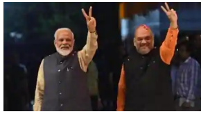
Amid pandemic woes, Modi govt to mark anniversary with accomplishments list