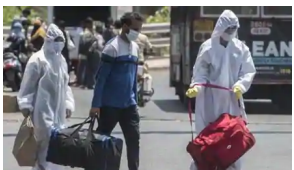
Maharashtra sees 116 deaths, 2,682 new Covid-19 cases take state tally past 62,000