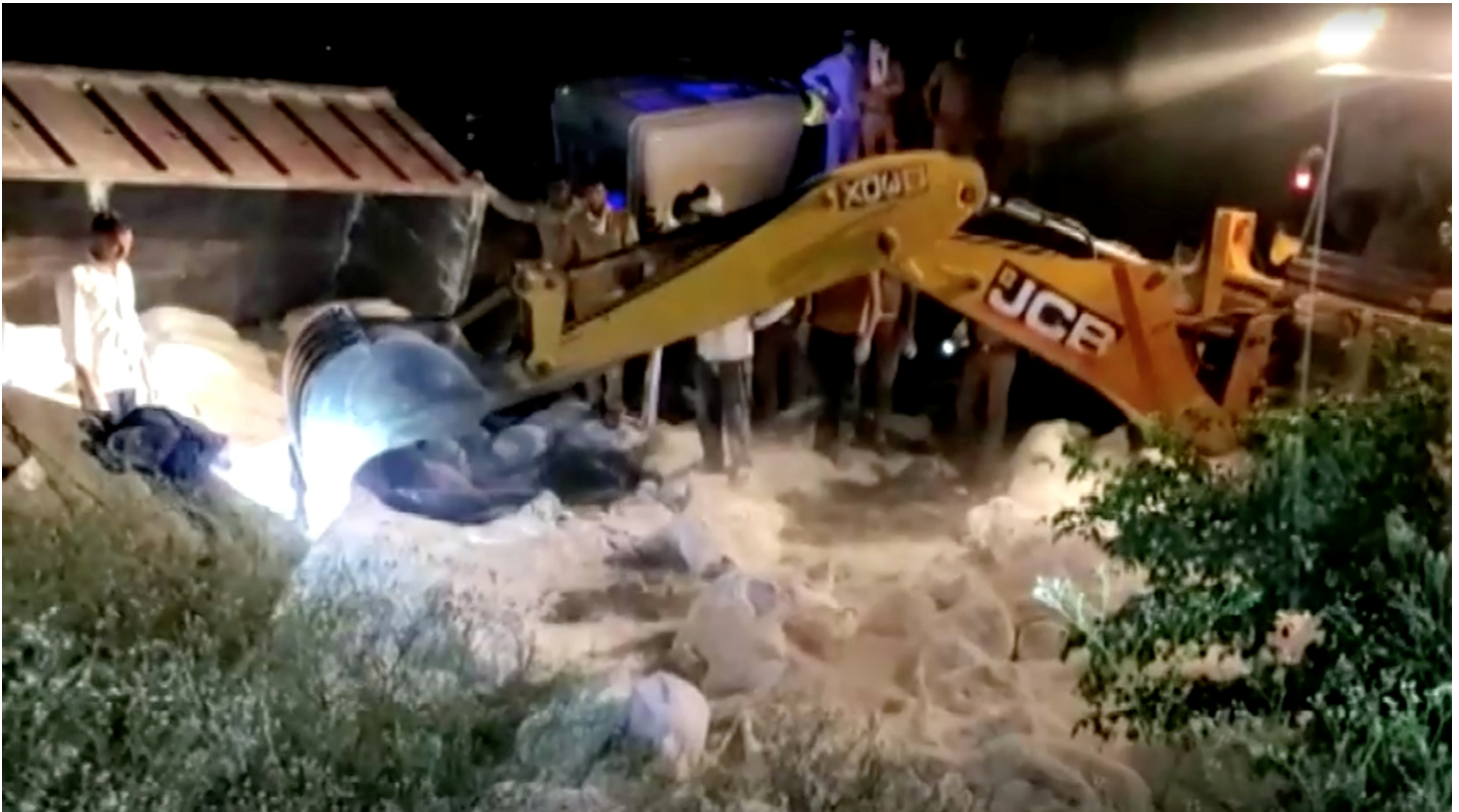
Two of the injured persons died subsequently.

PTI, Auraiya, MAY 18 2020, 19:35 IST | UPDATED: MAY 18 2020, 19:35 IST