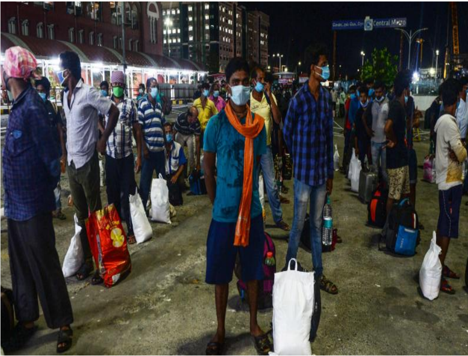
📷 Stranded migrant labourers queue to board a special train to hom.

Kolkata: Failing to return home for want of money, a young migrant worker from West Bengal committed suicide in Kerala on Saturday morning.