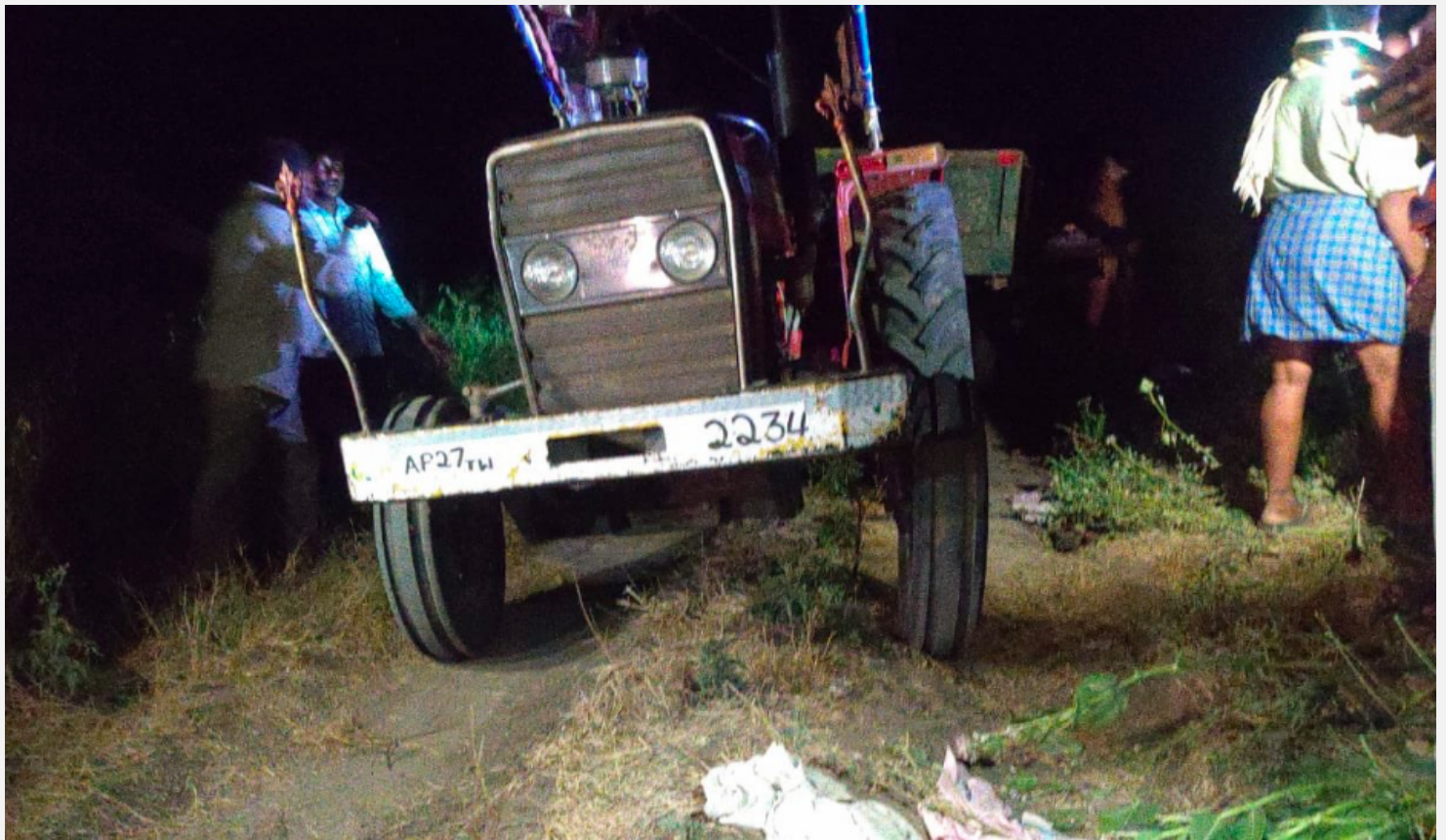
The tractor which was carrying the chilli plantation workers.