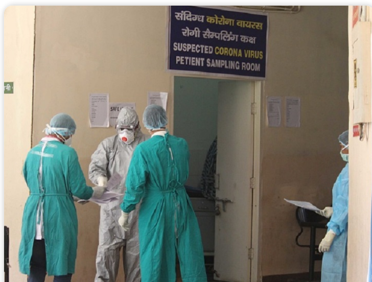
Representational Image

By : ABP News Bureau | 06 Apr 2020 11:35 AM (IST)