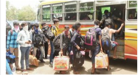
Buses give up migrants midway at Behrampore States