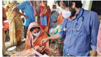
Doctors for cyclone-hit India