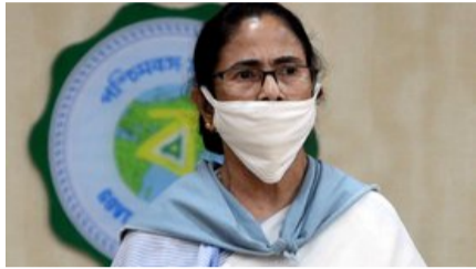
Mamata announces relaxations from June 1 West Bengal