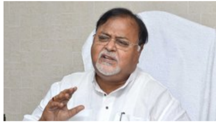
Bengal school students likely to attend classes on alternate days: Partha West Bengal