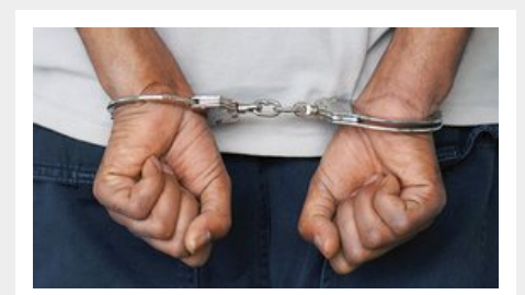
8 held for CAA activist's death in East Khasi Hills States