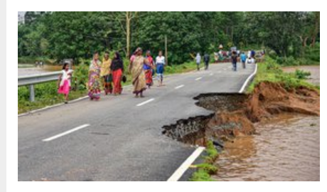
Erosion threatens villages in Bokakhat India