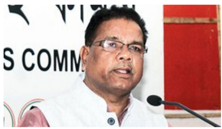
Five break into CM's convoy. North East

5. Generator suppliers around Calcutta make hay