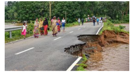
Erosion threatens villages in Bokakhat India