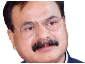
Assam woos MNCs with support States