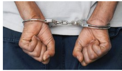
8 held for CAA activist's death in East Khasi Hills States