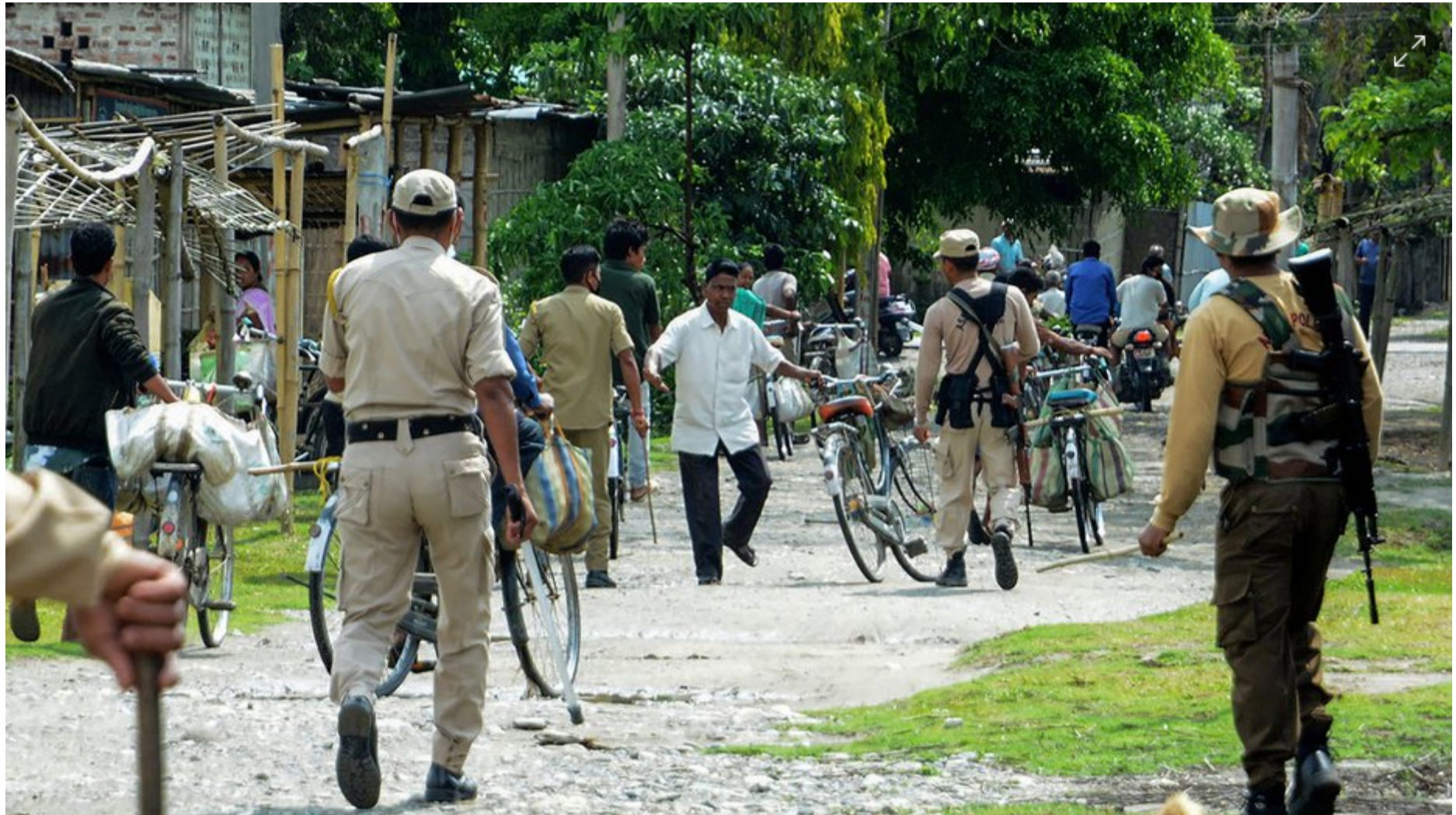
Police force villagers to go back to their homes as they were going to a market during ongoing Covid-19 lockdown, at Bagan Para in Baksa district of Assam on Sunday.

A migrant worker died in Jorhat district of Assam on Wednesday while walking from his workplace in Nagaland to his home in Golaghat district. He was one of the 200 migrant workers quarantined during the day after reaching Nakachari in Jorhat, covering about 170km on foot in three days.