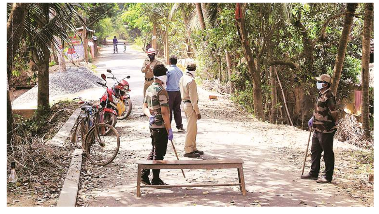
Policemen patrol a village Bengal.