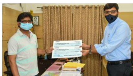
Ranchi district administration donates salary to CM Relief Fund