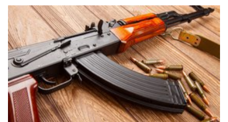
Three PLFI rebels killed in gun battle