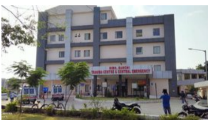
Doctor accuses senior colleague of rape attempt at RIMS Covid ward