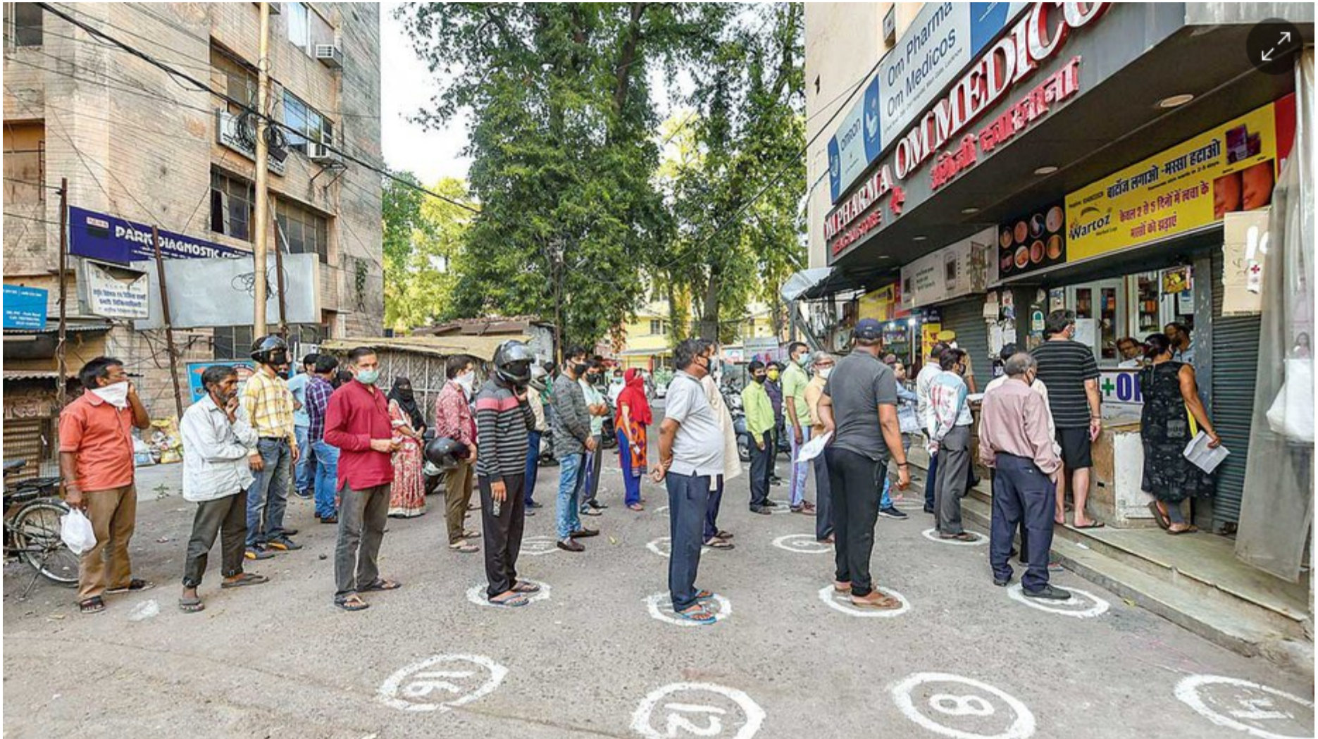
People observe social distance while waiting outside a chemist's shop in Lucknow on Wednesday.

T he wife of a sanitation worker in an Uttar Pradesh village has submitted a complaint to police blaming two panchayat officials for her husband's death, alleging they had forced him to spray chemicals in an area without any protective gear like mask or gloves.