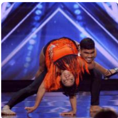
Watch: Indian duo ‘Bad Salsa’ stuns judges, audience with incredible dance at ‘America’s Got Talent’ 5 hours ago