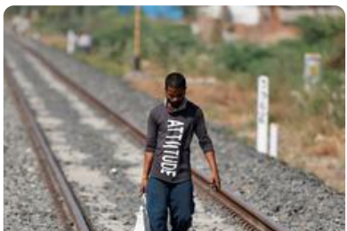
Migrant crisis: Labourer's body found lying in toilet of special train four days after he boarded it