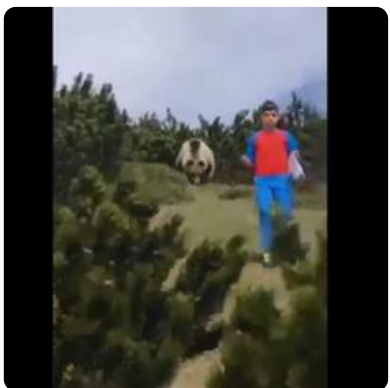
Watch: Giant bear surreptitiously stalks a 12-year-old boy walking down a hill, is caught on camera