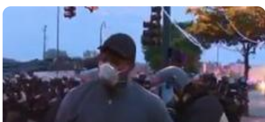
Watch CNN news team being arrested while live on air in Minneapolis 7 hours ago