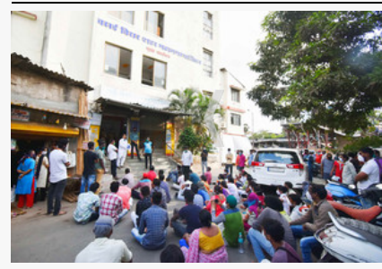
MUMBAI, MAY 29 (UNI):- Employee of Vasai Virar Mahanagar Palika staged a protest after termination from their job during the ongoing COVID-19 lockdown, in Mumbai on Friday