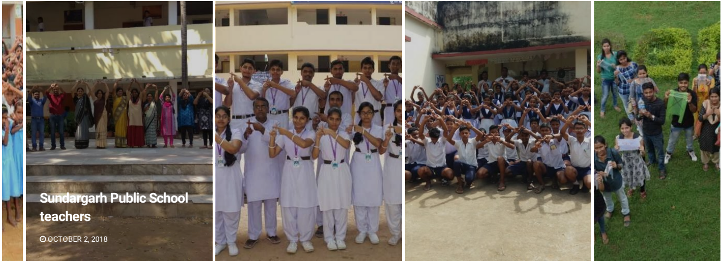
Sundargarh Public School teachers