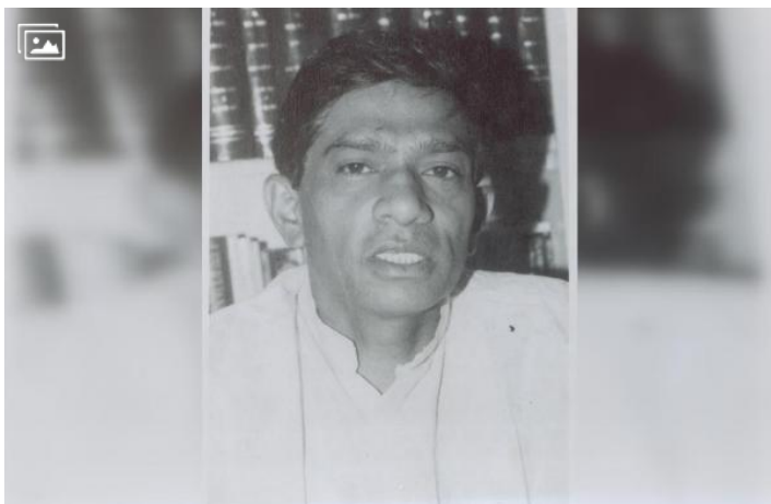
RIP Ajit Jogi: The IAS officer who went on to become Chhattisgarh's first chief minister