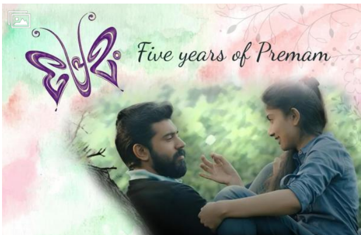
5 years of Premam: Best scenes from the Nivin Pauly-Sai Pallavi romantic hit that we all love to rewatch