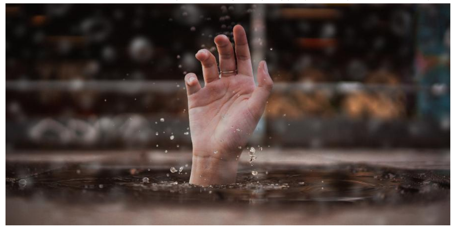
For representational purposes