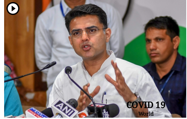
Sachin Pilot: Not enough was done by 15814885 help states fight Coronavirus Deaths 360412