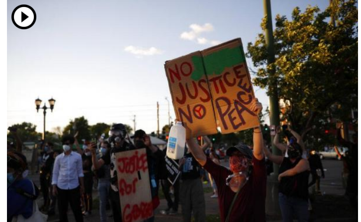
US condemns death of George Floyd, violent protests continue across the country