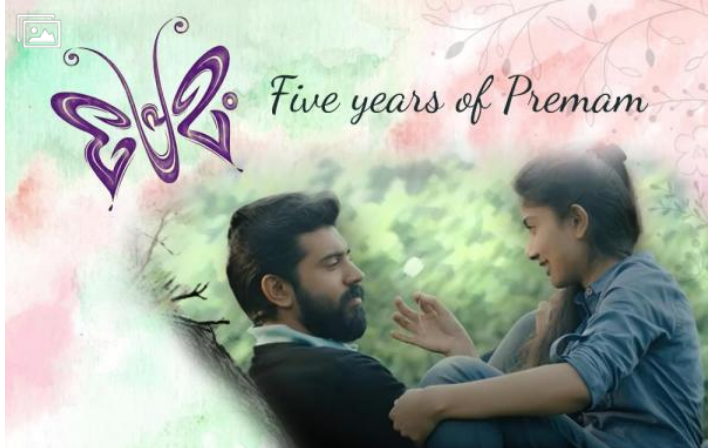
5 years of Premam: Best scenes from the Nivin Pauly-Sai Pallavi romantic hit that we all love to rewatch