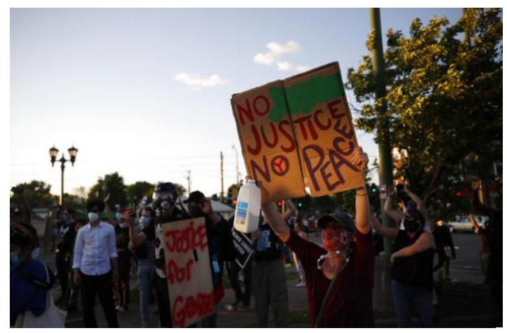
US condemns death of George Floyd, violent protests continue across the country