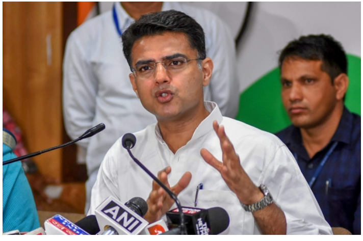
Sachin Pilot: Not enough was done by Delhi to help states fight Coronavirus