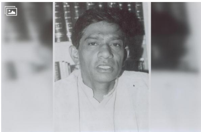
RIP Ajit Jogi: The IAS officer who went on to become Chhattisgarh's first chief minister