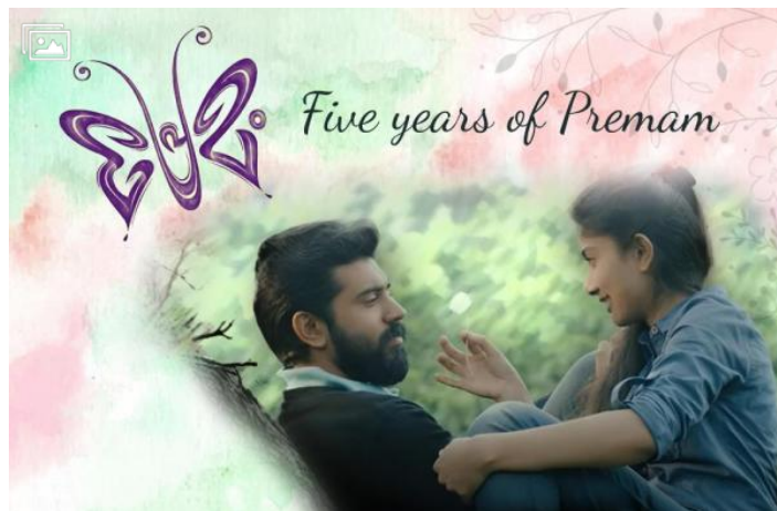
5 years of Premam: Best scenes from the Nivin Pauly-Sai Pallavi romantic hit that we all love to rewatch