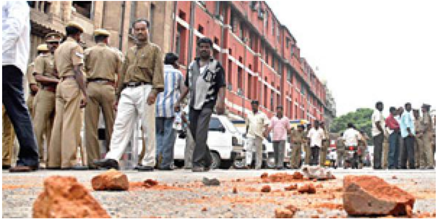
Southern Railways headquarters in Chennai shut as staff tests positive for COVID-19