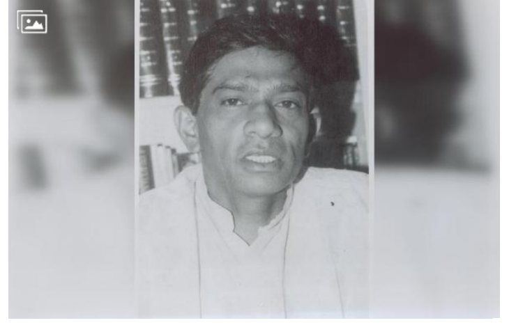
RIP Ajit Jogi: The IAS officer who went on to become Chhattisgarh's first chief minister

Migrant ends life after parents asked him to go in quarantine- The New Indian Express