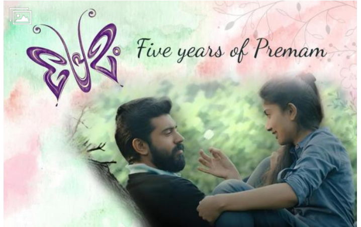
5 years of Premam: Best scenes from the Nivin Pauly-Sai Pallavi romantic hit that we all love to rewatch