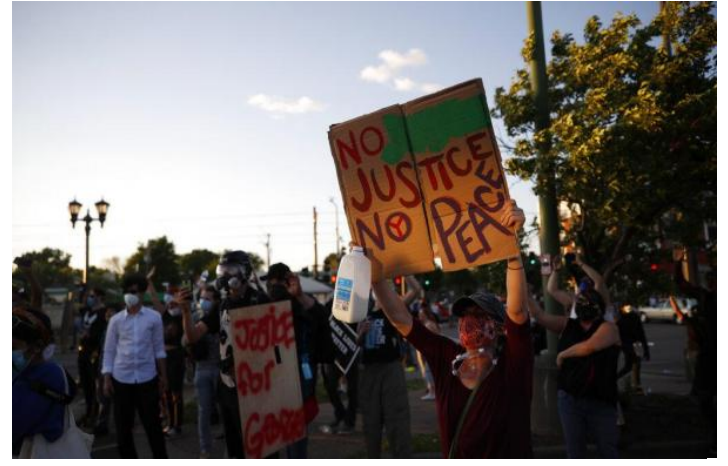
US condemns death of George Floyd, violent protests continue across the country

Migrant ends life after parents asked him to go in quarantine- The New Indian Express