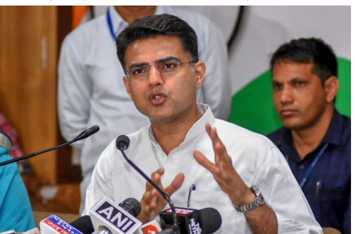
Sachin Pilot: Not enough was done by Delhi to help states fight Coronavirus