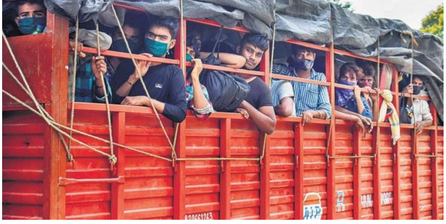
Migrants board a truck as they leave for their native villages in Prayagraj

Migrant ends life after parents asked him to go in quarantine- The New Indian Express