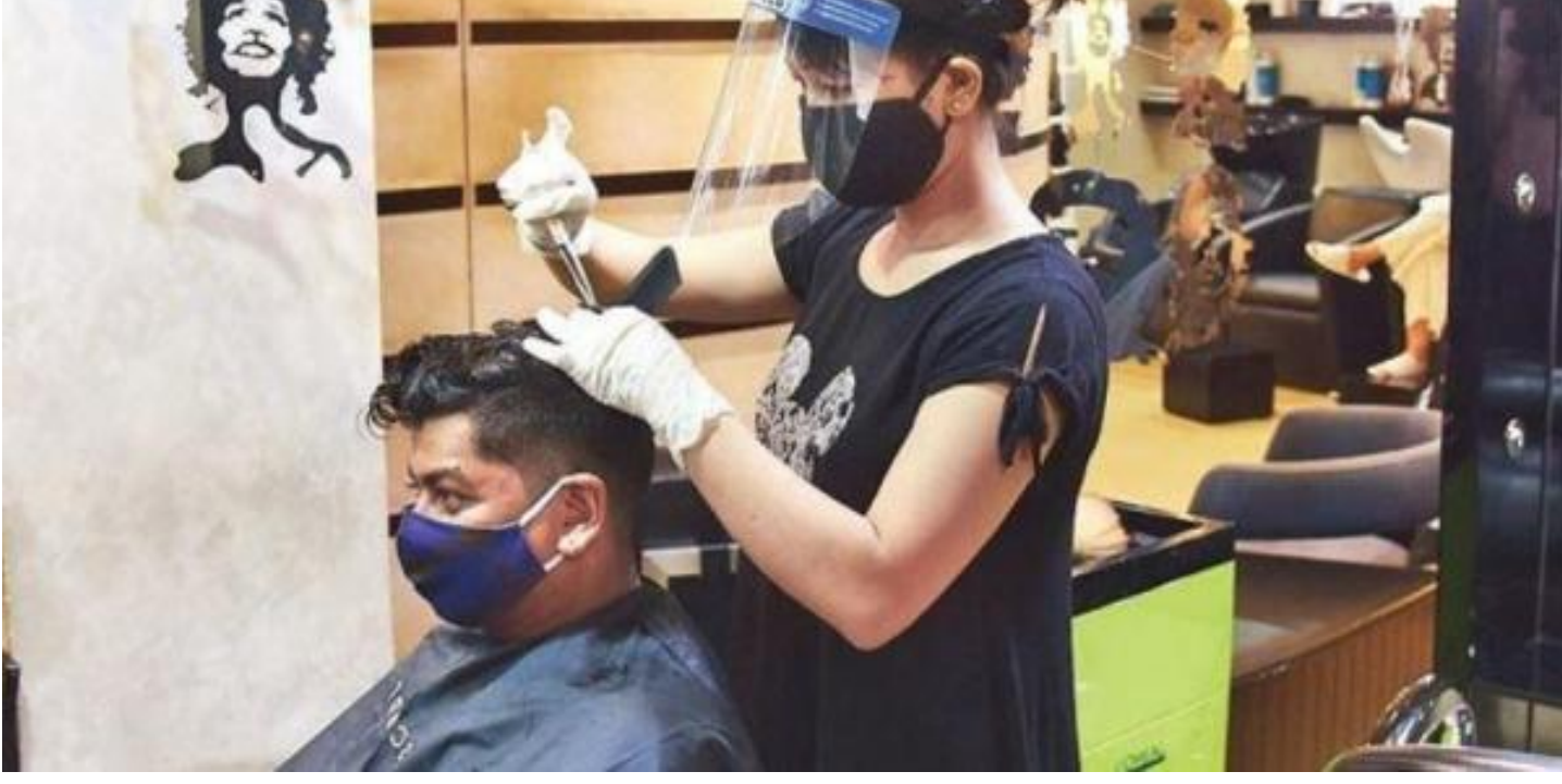
This is how getting a haircut post COVID-19 lockdown looks like

Migrant ends life after parents asked him to go in quarantine- The New Indian Express