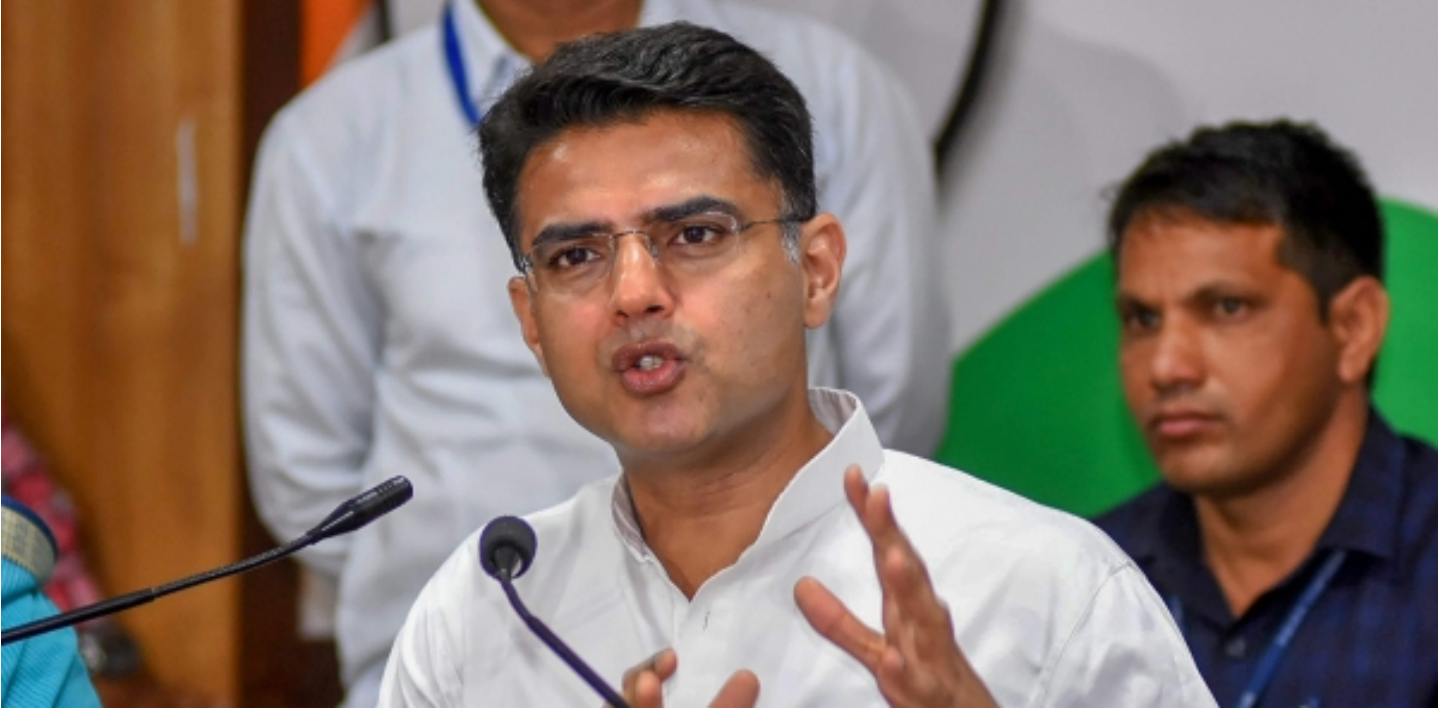
Sachin Pilot: Not enough was done by Delhi to help states fight Coronavirus

Migrant ends life after parents asked him to go in quarantine- The New Indian Express