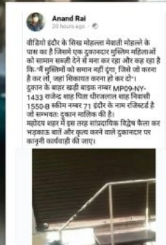
Screenshots from the video in which the vegetable vendor refused to sell to Muslims; The Facebook post highlighting the incident

Amid strict lockdown due to COVID-19 pandemic, a video of a vegetable vendor refusing to sell to women of the minority community, purportedly from Indore in Madhya Pradesh, has gone viral on social media during the past two days causing huge uproar.