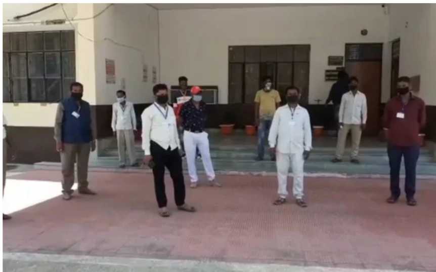
Coronavirus: A senior UP government officer has promised action in the matter.