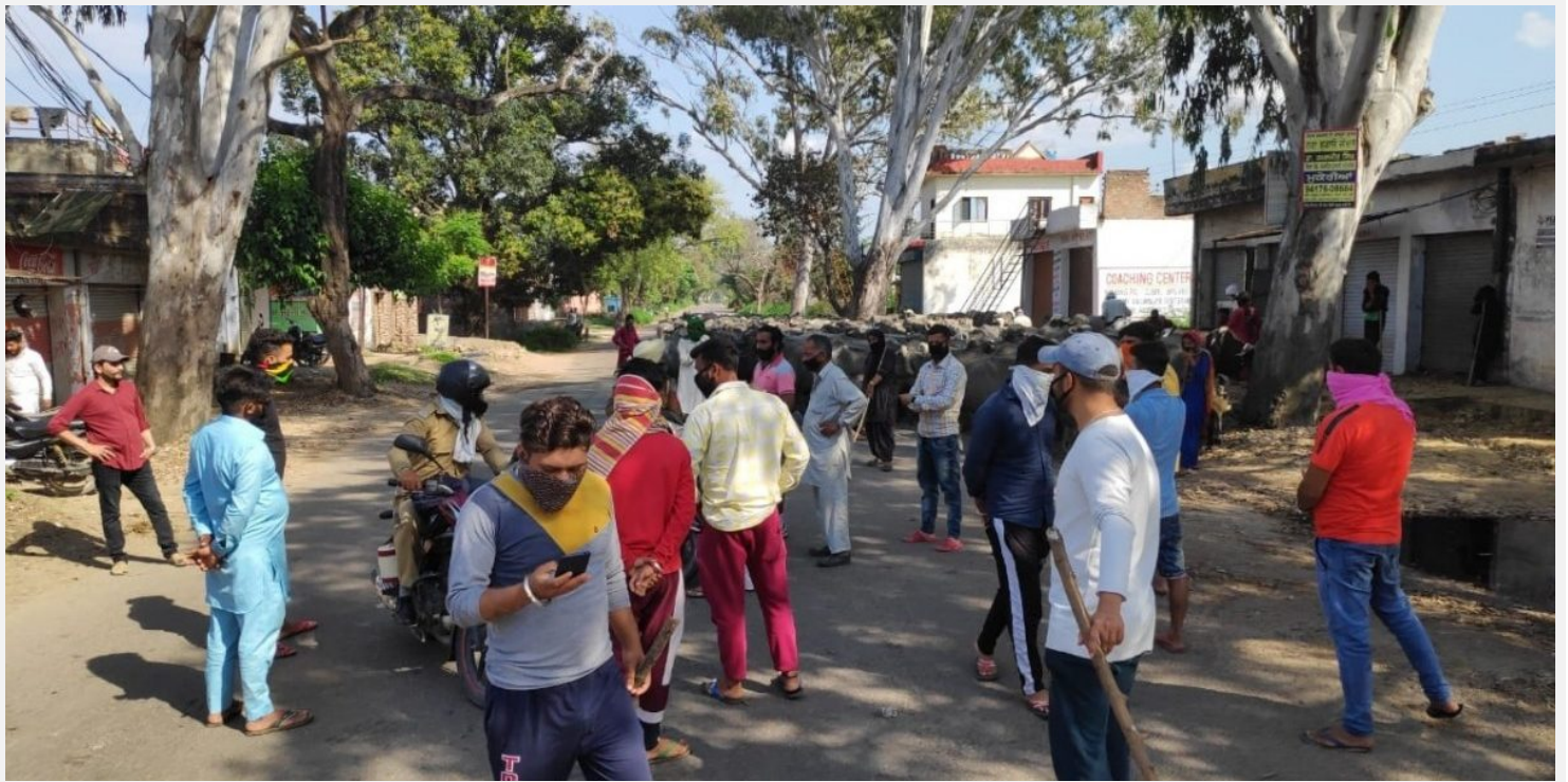
Gangs holding batons and lathis forcibly stopped Muslim Gujjar families who were on the move along with their cattle herds on the Talwara-Mukerian Road in Hajipur in Hoshiarpur district on Sunday, April 5.