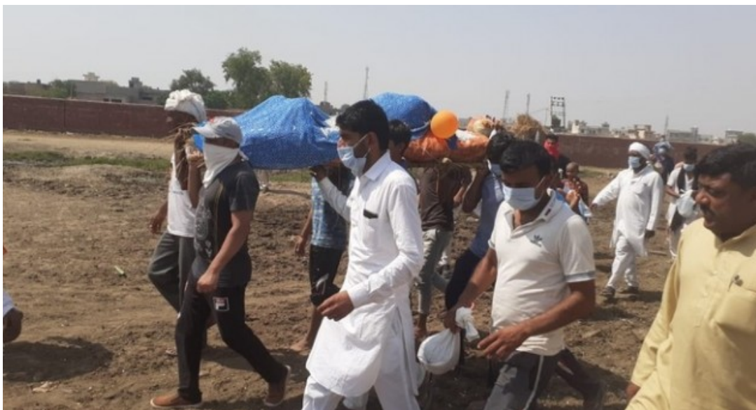
Body of an 80-year-old Muslim woman being taken for cremation by her family who converted to Hinduism in Hissar district of Haryana