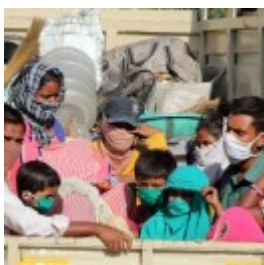
Don't Charge Train, Bus Fares From