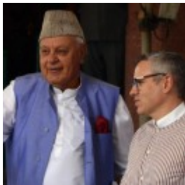
National Conference Announces to Boycott Delimitation Commission