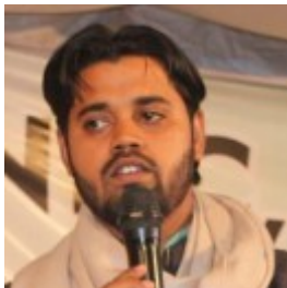
Police Probe "Seems Targeted To One End Only", "Fail To Investigate The Rival Faction's Role" In Delhi Riots: Delhi Court