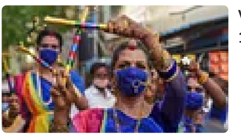
With Biggest Spike of 49K Cases, India's COVID-19 Tally at 12.87 L