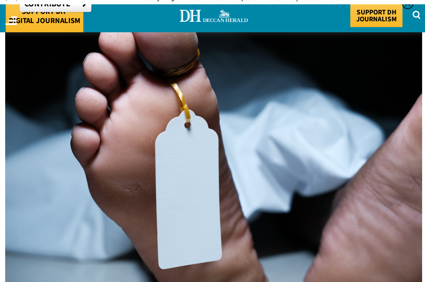
Representative image

An elderly migrant lodged in a quarantine centre in Odisha's Bhadrak district was found dead on Wednesday morning, an official said.