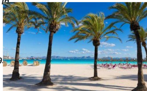
Travel corridors: All the countries UK holidaymakers can visit this summer