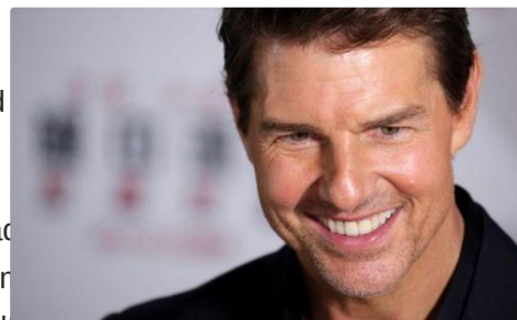
Norway quarantine is no obstacle for secret agent Ethan Hunt