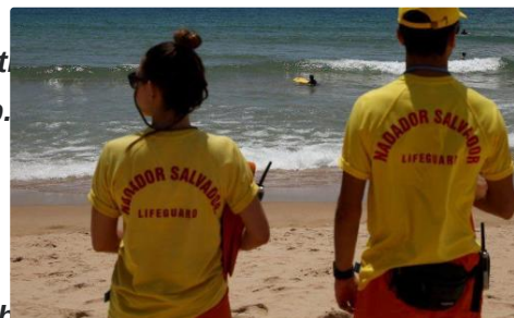
Coronavirus: Portugal still on quarantine holidaymakers