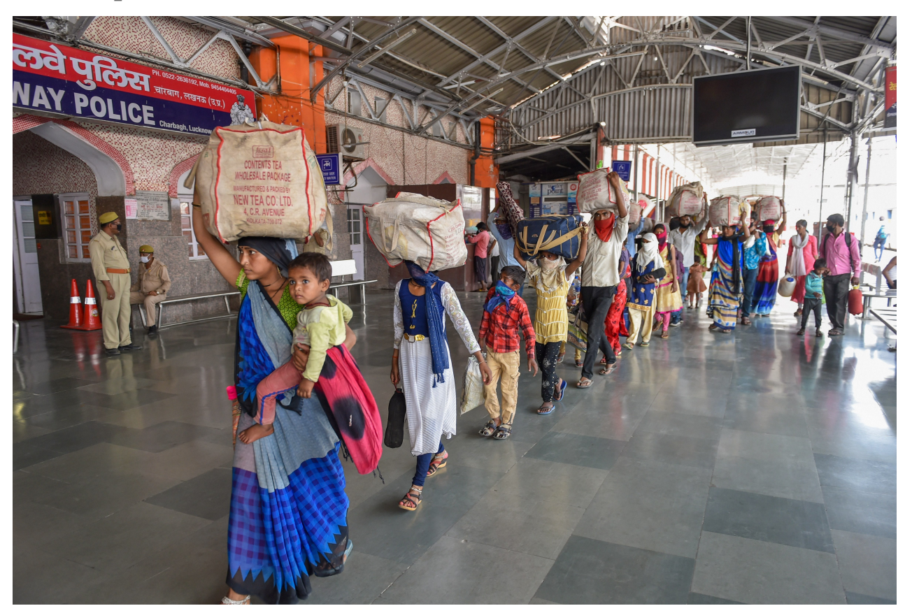
Migrants arrive to board a special train to at Charbagh railway station in Lucknow on Sunday.

Railway authorities pointed out that the 46-year-old labourer was a heart patient