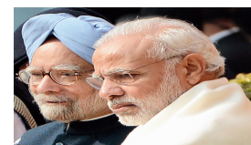
Clarity, not callisthenics