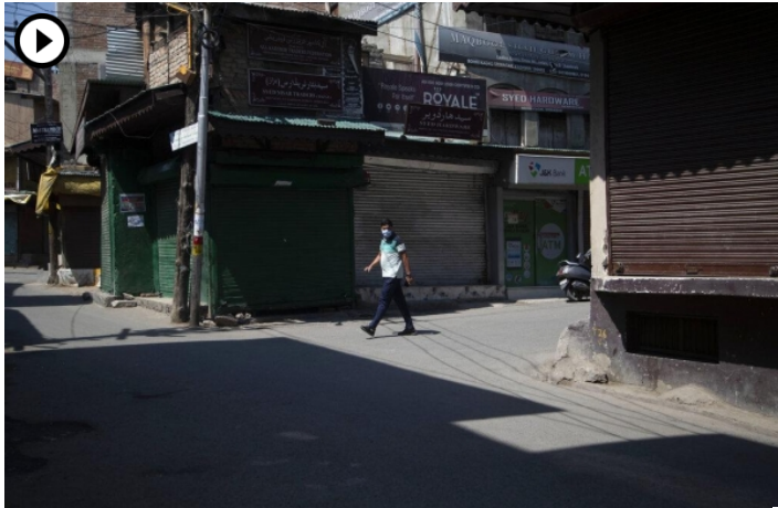
WATCH: Kashmir under lockdown again, this time due to coronavirus