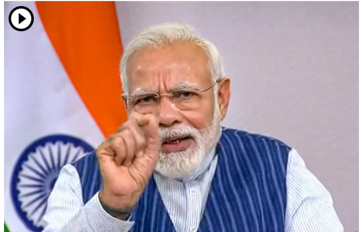
Northeast has the potential to become the growth engine of India : PM Modi