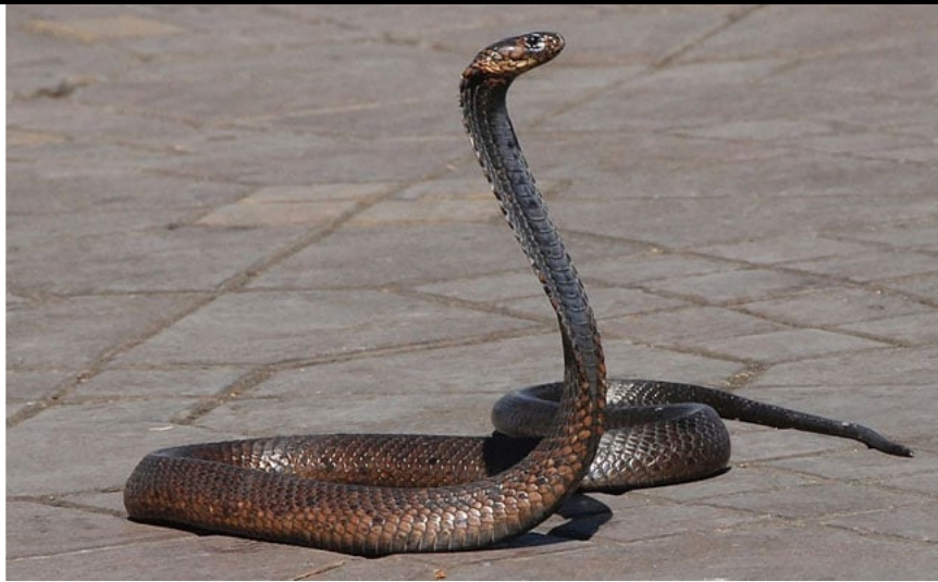
The man was sleeping on the floor outside his room when he was bitten by a snake. (Representational)

Entertainment Sonali And Rossellini - A Love Story 10 Slides