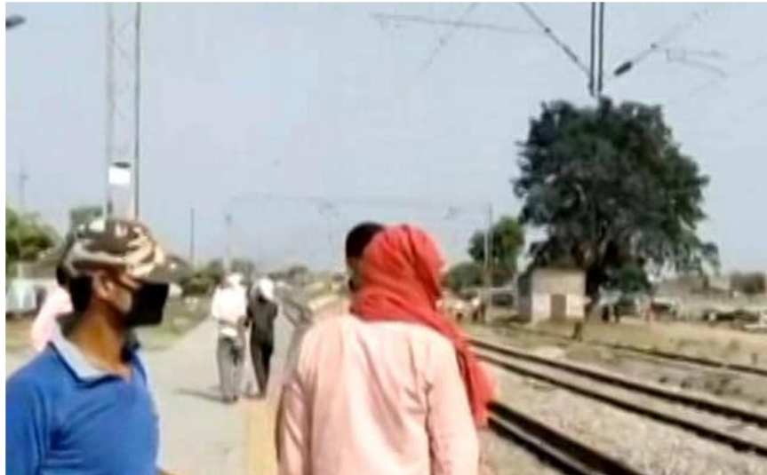
The body of the man was found on a rail track in Uttar Pradesh's Lakhimpur Kheri district