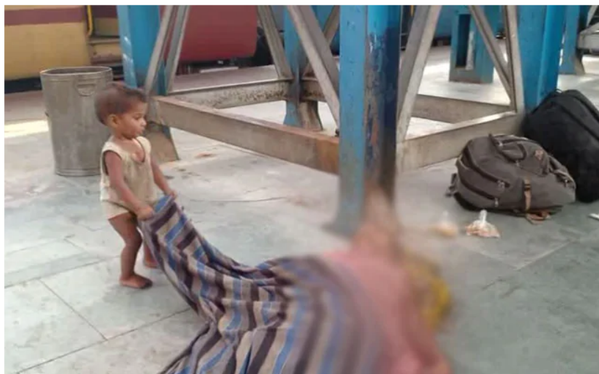
In the clip, the toddler tugs at the cloth partly covering his mother, lying motionless.

she had arrived in Bihar's Muzaffarpur on Shramik train