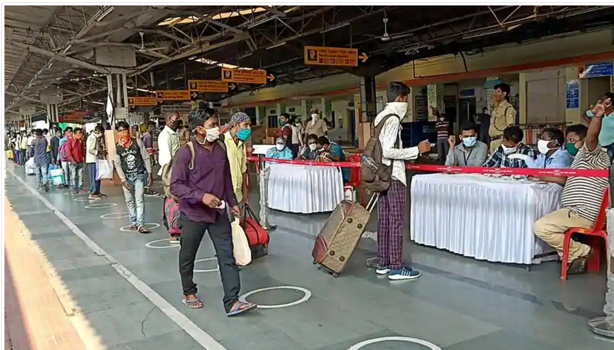
There have been 18 deaths in the North Eastern Railway zone, 19 in North Central zone and 13 in East Coast Railway zone.

ht Anisha Dutta Hindustan Times, New Delhi