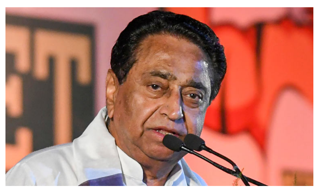
Former Madhya Pradesh Chief Minister Kamal Nath

Politics has started over the death of a farmer who had been in a queue for six days to sell his wheat produce at a government procurement centre in Agar Malwa district of Madhya Pradesh, with the opposition Congress attacking the BJP government vehemently over the issue.