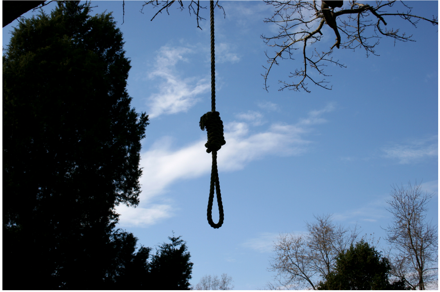
Representative image

PTI, JUN 05 2020, 15:26 IST | UPDATED: JUN 05 2020, 15:26 IST